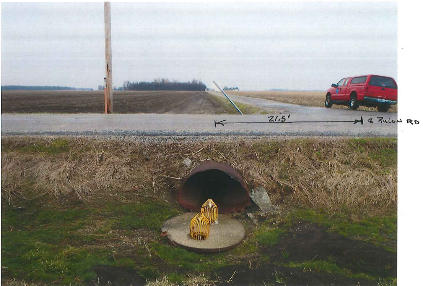
Looking South AT Junction Str. & CMP under Co. Line